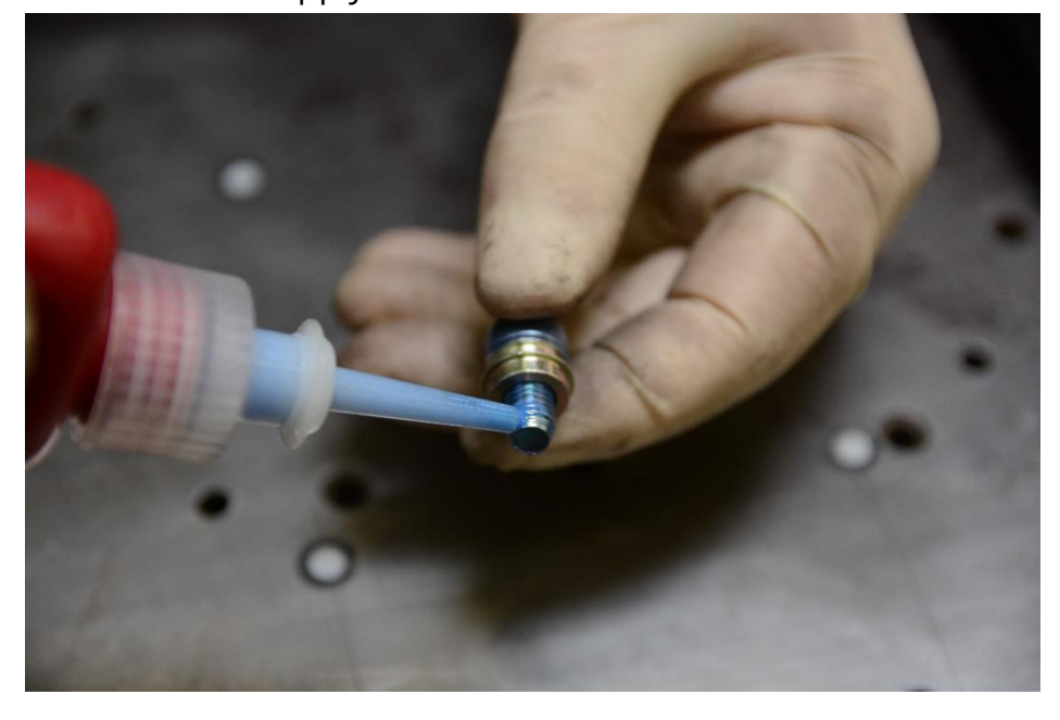
Step 8 Apply blue Loctite to allen bolt